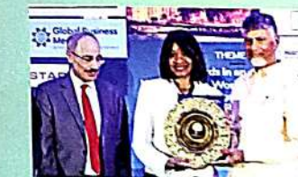
Mr. N. Chandrababu Naidu Hon'ble Chief Minister of Andhra Pradesh, India presenting the Golden Peacock Awards at the Annual London Global Convention 2025 in London