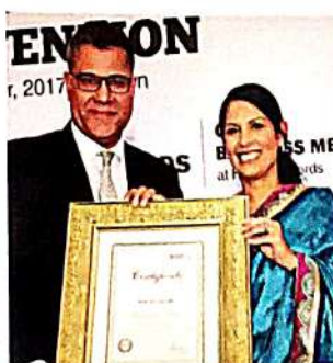
The Rt Hon Sir Alok Sharma KCMG MP, former President, COP26 and The Rt. Hon. Priti Patel MP, former Cabinet Minister & Home Secretary, Govt. of UK at the Annual London Global Convention 2017