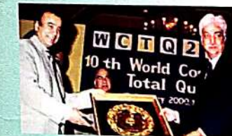
Dr. Azim H. Premji Chairman, Wipro Group receiving the Golden Peacock Business Leadership Award