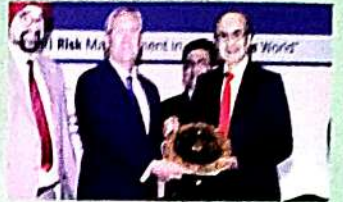
Mr. Adil Godrej Chairman, Godrej Group receiving the Golden Peacock Lifetime Achievement Award for Ethical Leadership