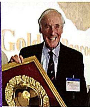
Sir George Adrian Hayhurst Cadbury Chairman, Cadbury and Cadbury Schweppes receiving the Golden Peacock Leadership Award for Lifetime Achievement in Corporate Governance

Even, if you don't win the award, the PREPARATION & FEEDBACK helps your strategic learning process to put you, on your way to achieving world class status