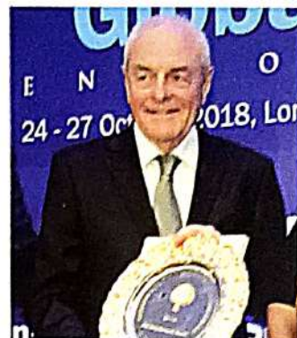
Prof. (Judge) Mervyn E. King SC Chairman, King Committee on Corporate Governance & former Judge, Supreme Court of South Africa receiving the Golden Peacock Global Award for Lifetime Achievement in Corporate Governance

Golden Peacock Awards, instituted by the Institute of Directors (IOD) , India in 1991, are now regarded as a benchmark of Corporate Excellence worldwide.