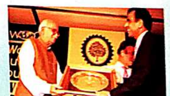
Mr. Sunil Bhardi Mittal Chairman, Bharat Enterprises receiving the Golden Peacock Business Leadership Award