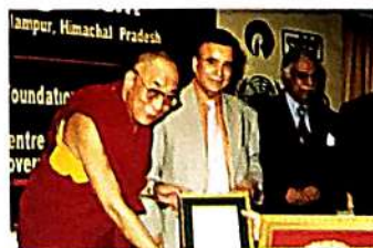
His Holiness The Dalai Lama presenting the Golden Peacock Awards in Palampur (Himachal Pradesh)