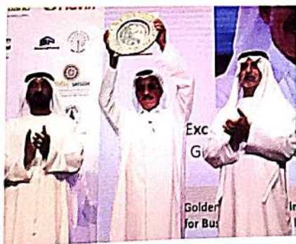
His Highness Sheikh Nahayan Bin Mubarak Al Nahayan, Cabinet Member and Minister of Tolerance, Govt. of UAE (Right) and His Highness Sheikh Ahmed Bin Saeed Al Maktoum, President, Dubai Civil Aviation Authority, Chairman and Chief Executive, The Emirates Airline & Group Chairman, Dubai World (Left) presenting the Golden Peacock Award to H.E. Dr. Khalaf Ahmad Al Habtoor, Group Chairman, Al Habtoor Group, UAE (centre)

To create an Intra-Sector competitiveness , Golden Peacock Awards are considered separately under various Business Sectors and Sub-Sectors .