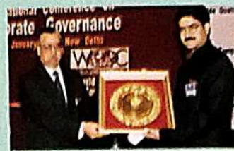
Mr. Kumar Mangalam Birla Chairman, Aditya Birla Group receiving the Golden Peacock Business Leadership Award