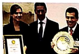
Banco Bradesco SA, Brazil receiving the Golden Peacock Award in Lisbon (Portugal)