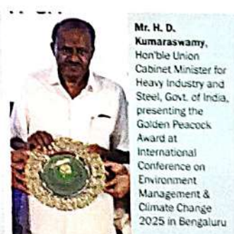
Mr. H. D. Kumaraswamy, Hon'ble Union Cabinet Minister for Heavy Industry and Steel, Govt. of India, presenting the Golden Peacock Award at International Conference on Environment Management & Climate Change 2025 in Bengaluru