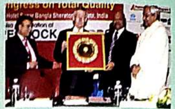
Mr. Anil Agarwal Founder Chairman, Vedanta Group receiving the Golden Peacock Business Leadership Award. Also seen (on right), Mr. Mayeen Patnaik , Hon'ble Chief Minister, Govt. of Odisha