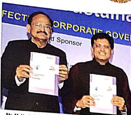
Mr. M. Venkalah Naidu, (the then) Hon'ble Union Minister of Urban Development, Housing and Urban Poverty Alleviation and Parliamentary Affairs, Govt. of India and Mr. Piyush Goyal, (the then) Hon'ble Union Minister of State with Independent Charge for Power, Coal and New & Renewable Energy, Govt. of India at the IOD Annual Meet in 2014

A Strategic Tool to Lead the Competition