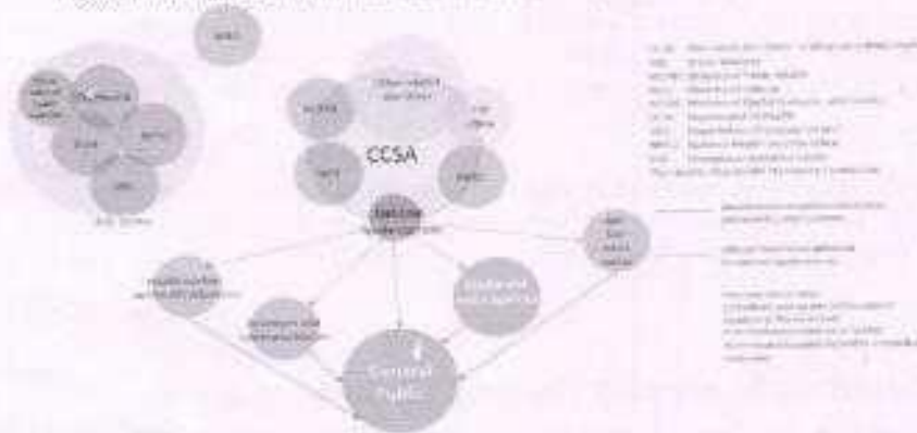
Flow of information in the risk communication system in Thailand

Tedros Adhanom Ghebreyesus WHO Director-General Munich Security Conference, 11 February 2020