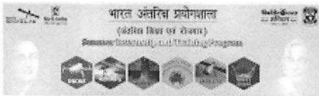
ISL- Summer Internship.png 1187K